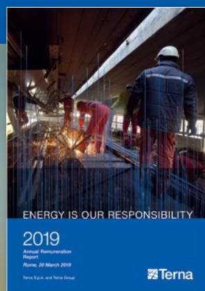
Annual Remuneration Report