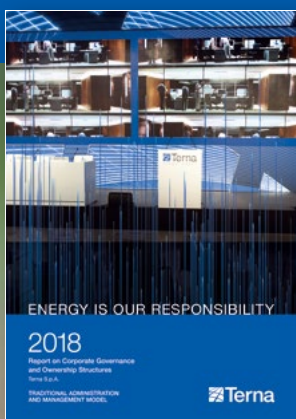
Report on Corporate Governance and Ownership Structures

They are the end result of a series of deliberate choices in terms of transparency, communication, accuracy, completeness and the linking of disclosures, and mark the culmination of a sequence of complex processes involving a large number of people from across the Company.